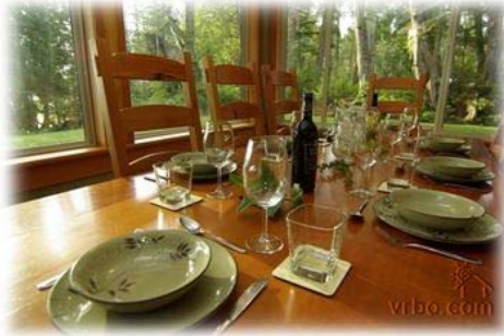
An evening full of dining - Tofino Ocean Retreat House In Clayquot Calm