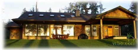
Sunset at Clayquot Calm

Tofino, British Columbia Vacation Rental by Owner Listing 276120