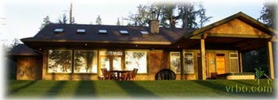
Sunset at Clayquot Calm - Tofino Ocean Retreat House In Clayquot Calm