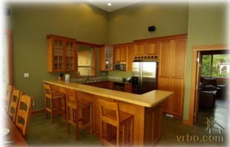
Custom Gourmet Kitchen - Tofino Ocean Retreat House In Clayquot Calm