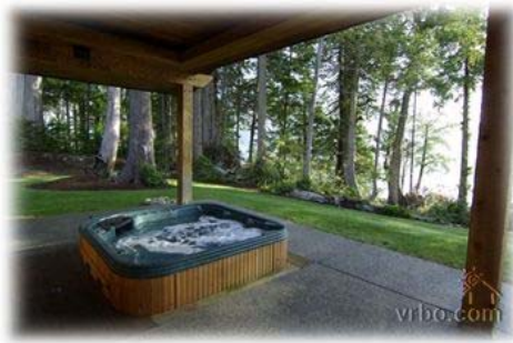
Enjoy the hot tub and the view