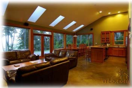
Living room with a view