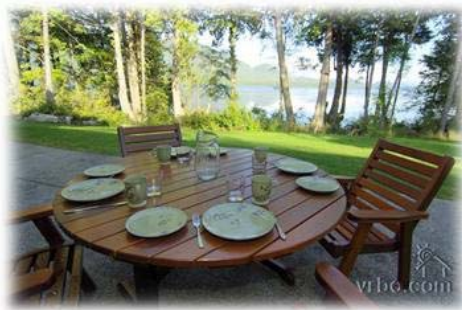
enjoy your breakfast outdoors